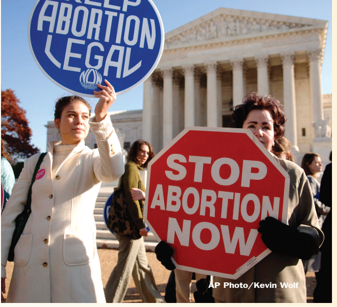
Thirty-six years after Roe v. Wade , the debate continues.

that are not the government's business. Women were the ultimate beneficiaries of the extension of this new reproductive authority. No longer could husbands, partners, fathers and doctors legally prevent women (both married and single) from obtaining and using birth control methods, although it wasn't until 1965 that the Court declared a ban on the use of contraception unconstitutional.