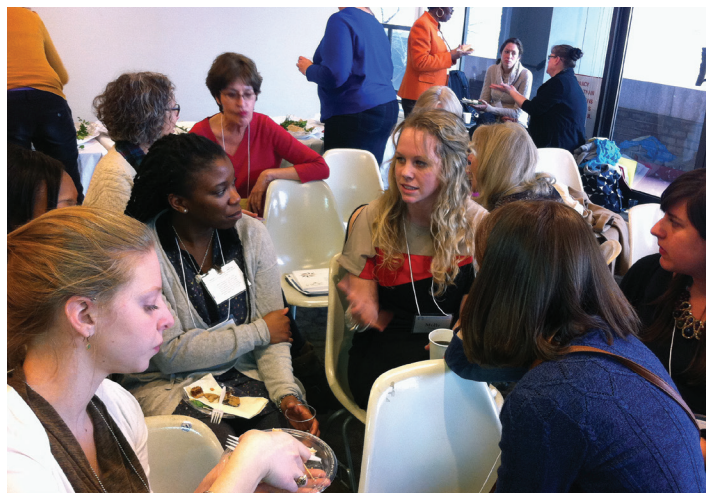
Participants at the Commission on the Status of Women gather in small groups during one of the week’s sessions.