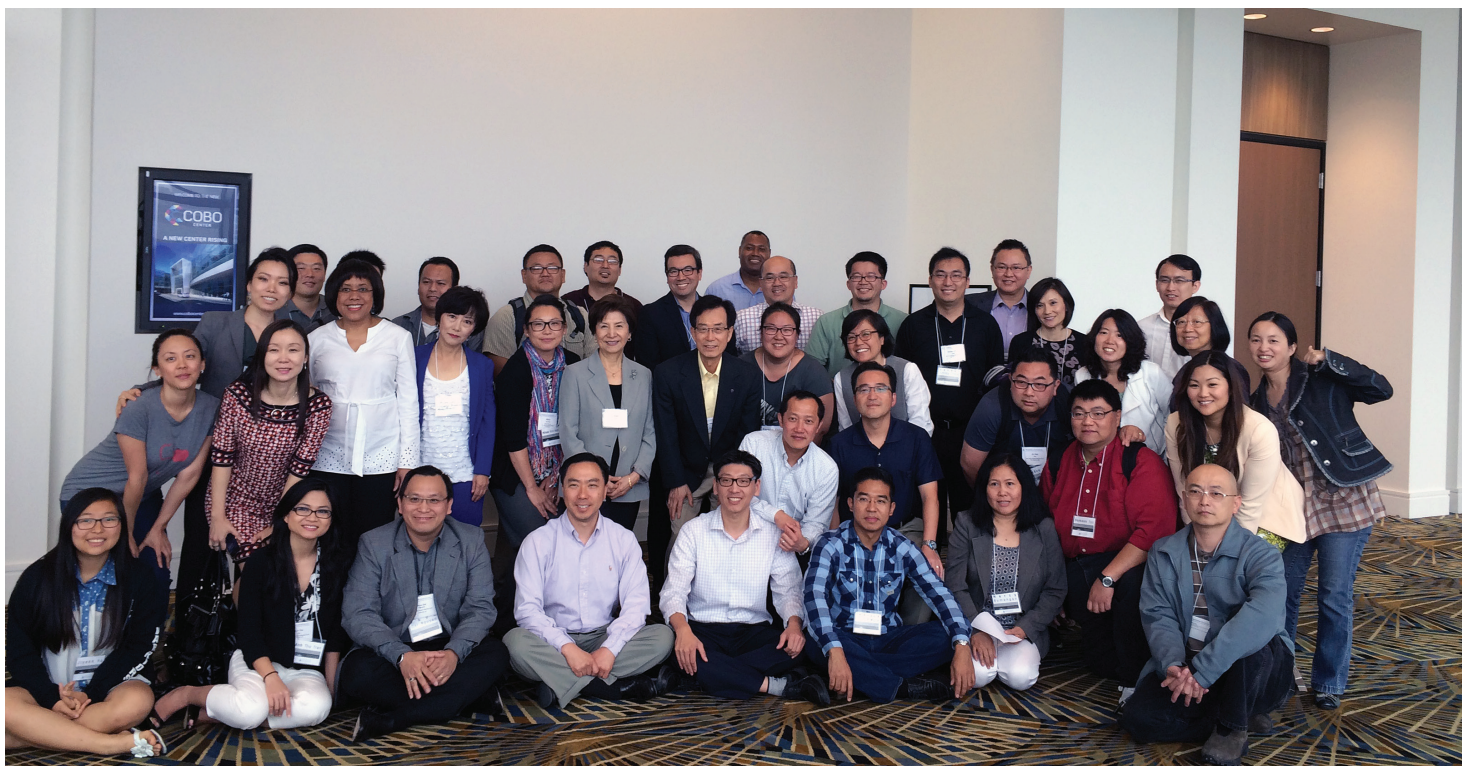
Participants of the Pan Asian English Ministry Pastors Conference gathered in Detroit, Michigan before the 221st General Assembly

Dramatic shifts in demographics and generational trends are changing the landscape in the church, capturing the attention of Asian English ministry pastors at the first-ever Pan Asian English Ministry Pastors Conference. Sponsored by Racial Ethnic & Women's Ministries, the conference was held in Detroit just before the 221st General Assembly.