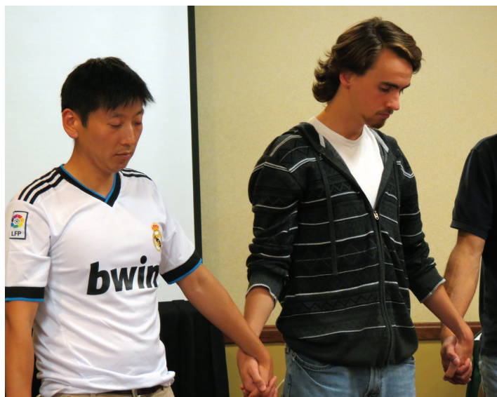
Young adults gather together in prayer during an event in Louisville earlier this year.

facing to find solutions, and learn new ways to ignite excitement among Presbyterian youth and young adults.