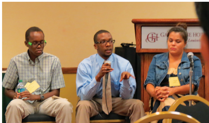
Participants engage in conversations about their experiences in ministry during a recent gathering in Louisville.

He says it’s important to encourage those in youth ministry so they can help close the gap between generations and create understanding. That means being supportive and allowing them to attend workshops so they can recharge, share the challenges they’re