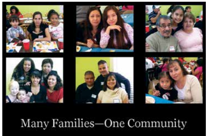
Many Families—One Community

The partnership with Presbyterian congregations in the area remains strong, as dozens of volunteers from these churches serve in El Buen Pastor’s various programs and share resources.