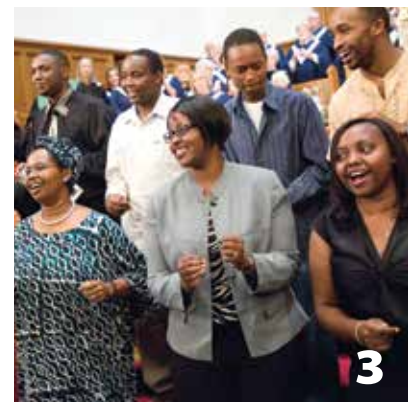
On the cover: More than 100 leaders from the PC(USA) met in the Dominican Republic for the Hispanic/Latino Pastoral Development Seminar (see page 2).