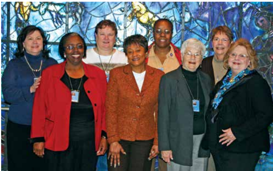
Presbyterian Women's Delegation meets at the UN Commission on the Status of Women in New York City.

"PW's purpose statement is a purpose you can live by," she said. "We believe in justice and peace. In order to do the will of God, we must be concerned for our neighbor. We, as faith-filled women, will not just sit by and be comfortable and satisfied if others are suffering. Presbyterian Women have that passion to make the world a better place for all God's people."