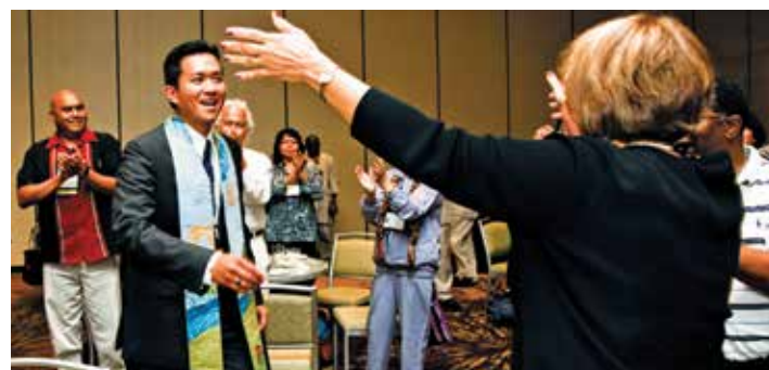
The moderator was greeted with smiles and hugs as he entered the Moderator’s Reception hosted by RE&WM.

Presbyterians represented multiple racial ethnic groups, including African Americans, Koreans, Native Americans, Middle Easterners, Asians, Hispanic/Latino-as, new immigrants, and others.