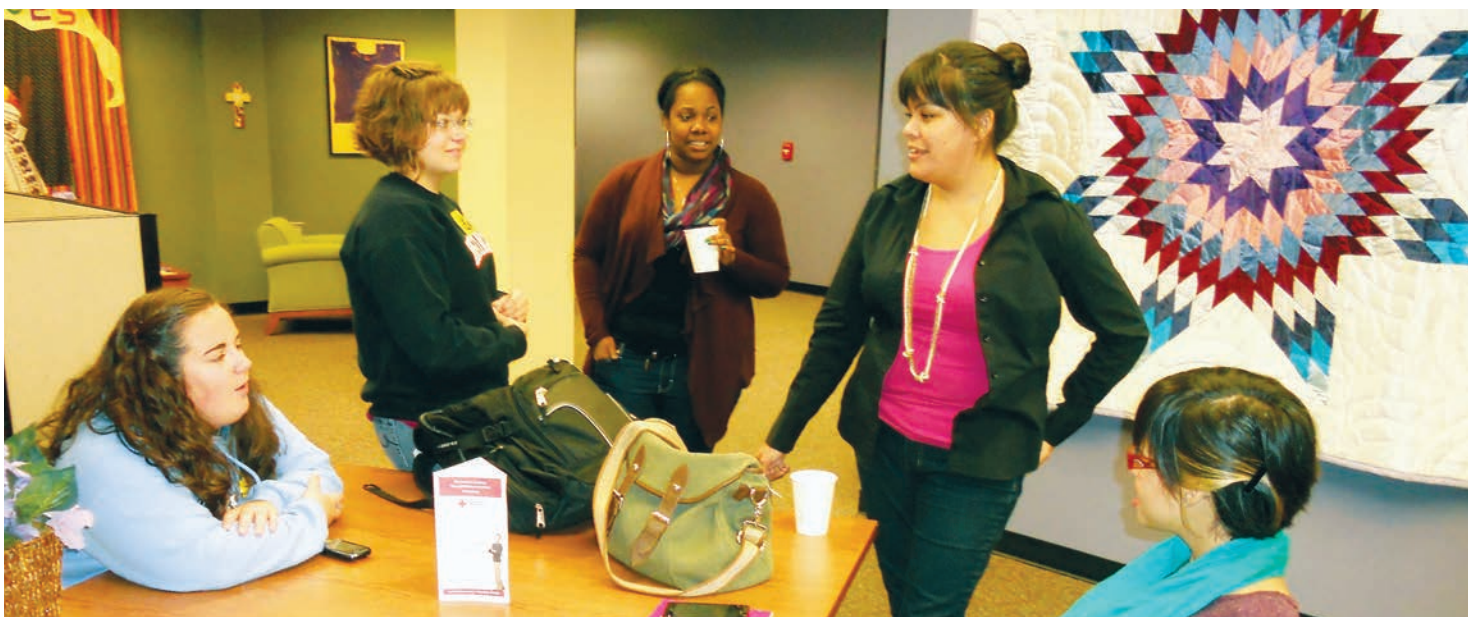
Leadership of the young women's programs supported by RE&WM/PW