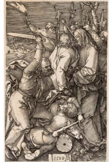
Albrecht Dürer, The Betrayal of Christ, 1508

and the elders. His betrayer had arranged a signal with them, saying, "The man I shall kiss is the one; arrest him and lead him away securely." He came and immediately went over to him and said, "Rabbi." And he kissed him. At this they laid hands on him and arrested him.