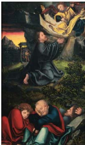
Cranach, The Garden of Gethsemane , 1518

Then Jesus came with them to a place called Gethsemane, and he said to his disciples, "Sit here while I go over there and pray." He took along Peter and the two sons of Zebedee, and began to feel sorrow and distress. Then he said to them, "My soul is sorrowful even to death. Remain here and keep watch with me." He advanced a little and fell prostrate in prayer, saying, "My Father, if it is possible, let this cup pass from me; yet, not as I will, but as you will." When he returned to his disciples he found them asleep. He said to Peter, "So you could not keep watch with me for one hour? Watch and pray that you may not undergo the test. The spirit is willing, but the flesh is weak."