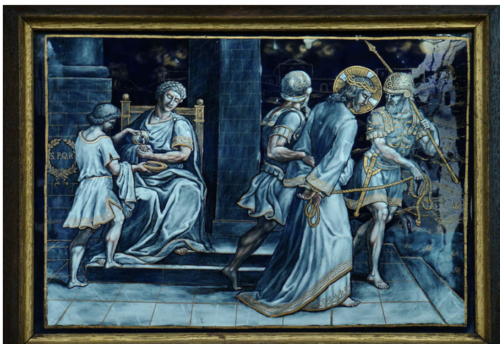
One of the Limoges enamel stations of the cross, Church of Notre-Dame-des-Champs, Avranches, Manche, Normandie, France.

The Sanhedrin police bound Jesus, led him away, and handed him over to Pilate. Pilate questioned him, "Are you the king of the Jews?" He said to him in reply, "You say so." The chief priests accused him of many things. Again Pilate questioned him, "Have you no answer? See how many things they accuse you of." Jesus gave him no further answer, so that Pilate was amazed.... Pilate, wishing to satisfy the crowd, released Barabbas... [and] handed [Jesus] over to be crucified.