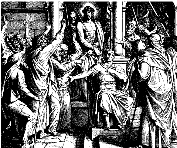
Woodcut for Die Bibel in Bildern , 1860

When the chief priests and the guards saw [Jesus] they cried out, "Crucify him, crucify him!" Pilate said to them, "Take him yourselves and crucify him. I find no guilt in him." . . . They cried out, "Take him away, take him away! Crucify him!" Pilate said to them, "Shall I crucify your king?" The chief priests answered, "We have no king but Caesar." Then he handed him over to them to be crucified. So they took Jesus . . . out to what is called the Place of the Skull, in Hebrew, Golgotha.