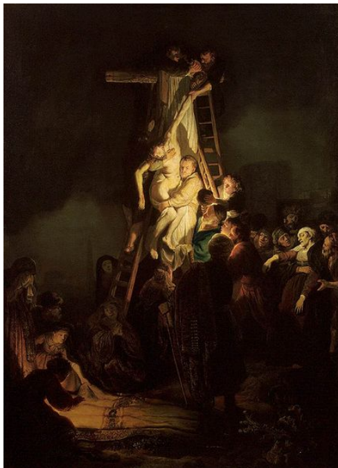
Rembrandt, Descent from the Cross , 1634

When it was evening, there came a rich man from Arimathea named Joseph, who was himself a disciple of Jesus. He went to Pilate and asked for the body of Jesus; then Pilate ordered it to be handed over. Taking the body, Joseph wrapped it [in] clean linen and laid it in his new tomb that he had hewn in the rock. Then he rolled a huge stone across the entrance to the tomb and departed.