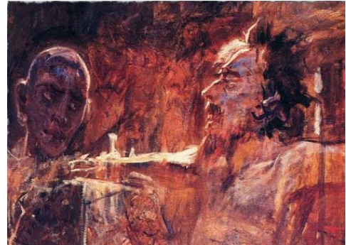
Nicolai Nikolajewitsch Ge, Christ and the Thief , 1893

Now one of the criminals hanging there reviled Jesus, saying, "Are you not the Messiah? Save yourself and us." The other, however, rebuking him, said in reply, "Have you no fear of God, for you are subject to the same condemnation? And indeed, we have been condemned justly, for the sentence we received corresponds to our crimes, but this man has done nothing criminal." Then he said, "Jesus, remember me when you come into your kingdom." He replied to him, "Amen, I say to you, today you will be with me in Paradise."