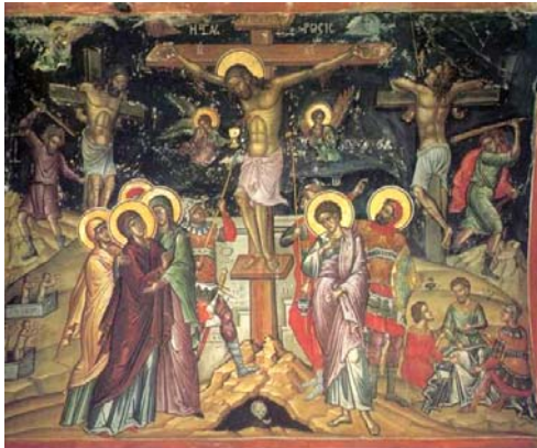
Theophanes the Cretan, Crucifixion , c. 1550

Standing by the cross of Jesus were his mother and his mother's sister, Mary the wife of Clopas, and Mary of Magdala. When Jesus saw his mother and the disciple there whom he loved, he said to his mother, "Woman, behold, your son." Then he said to the disciple, "Behold, your mother." And from that hour the disciple took her into his home.