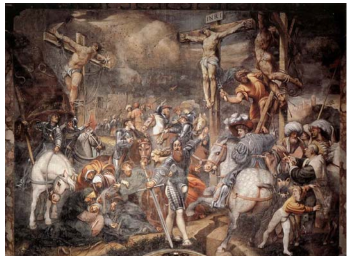
Il Pordenone, Golgotha , Cathedral of Cremona, c. 1520.

When they came to the place called the Skull, they crucified him and the criminals there, one on his right, the other on his left. Then Jesus said, "Father, forgive them, they know not what they do."