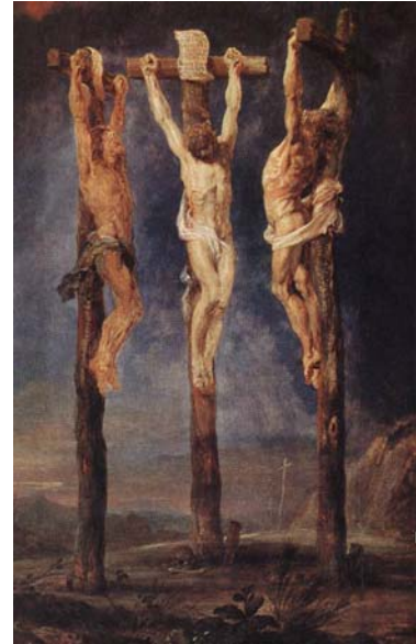
Peter Paul Rubens, The Three Crosses , c. 1625

It was now about noon and darkness came over the whole land until three in the afternoon because of an eclipse of the sun. Then the veil of the temple was torn down the middle. Jesus cried out in a loud voice, "Father, into your hands I commend my spirit"; and when he had said this he breathed his last.