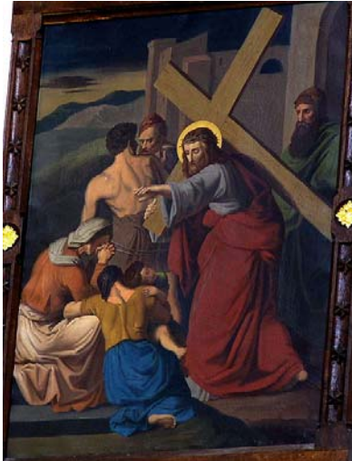
Church of the Anunciation in Zarnowiec, Poland, Jesus meets the daughters of Jerusalem

A large crowd of people followed Jesus, including many women who mourned and lamented him. Jesus turned to them and said, "Daughters of Jerusalem, do not weep for me; weep instead for yourselves and for your children, for indeed, the days are coming when people will say, 'Blessed are the barren, the wombs that never bore and the breasts that never nursed.' At that time, people will say to the mountains, 'Fall upon us!' and to the hills, 'Cover us!' for if these things are done when the wood is green what will happen when it is dry?"