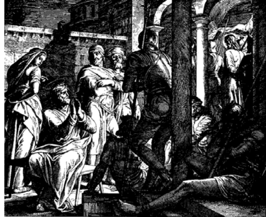
Woodcut for Die Bibel in Bildern, 1860

Now Peter was sitting outside in the courtyard. One of the maids came over to him and said, "You too were with Jesus the Galilean." But he denied it in front of everyone, saying, "I do not know what you are talking about!" As he went out to the gate, another girl saw him and said to those who were there, "This man was with Jesus the Nazorean." Again he denied it with an oath, "I do not know the man." A little later the bystanders came over and said to Peter, "Surely you too are one of them; even your speech gives you away." At that he began to curse and to swear, "I do not know the man!" And immediately a cock crowed. Then Peter remembered the word that Jesus had spoken: "Before the cock crows you will deny me three times." He went out and began to weep bitterly.