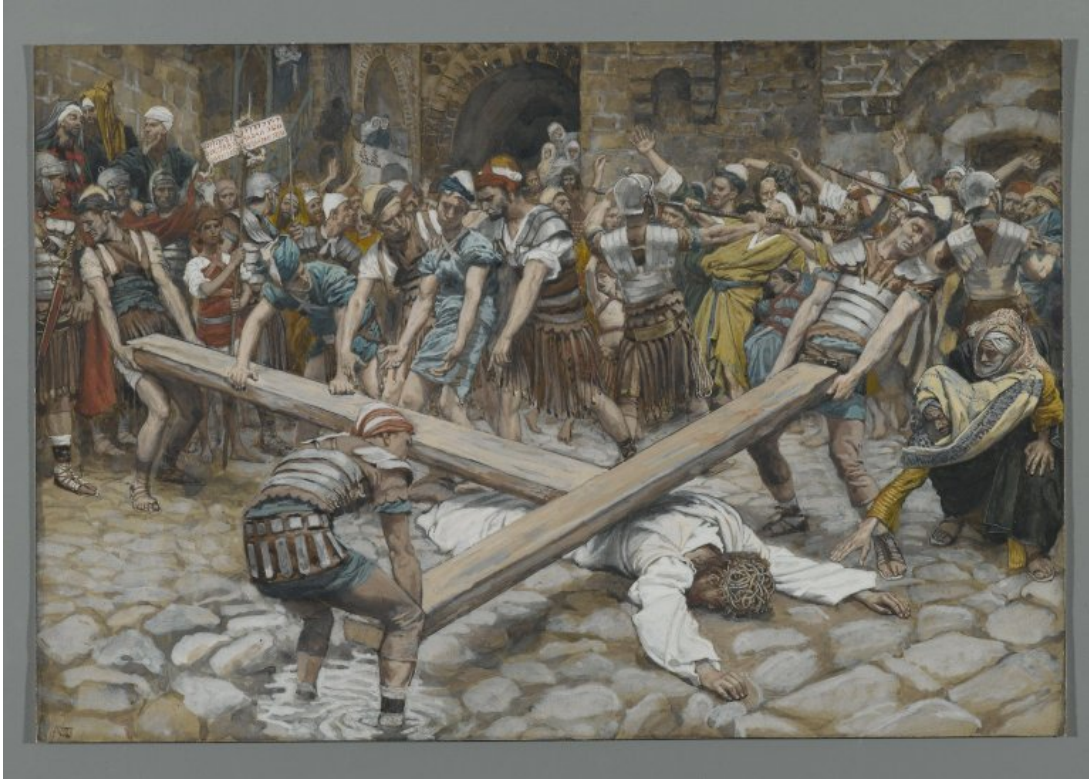
James Tissot, Simon the Cyrenian Compelled to Carry the Cross with Jesus , c. 1890.

The Roman police pressed into service a passer-by, Simon, a Cyrenian, who was coming in from the country, the father of Alexander and Rufus, to carry his cross.