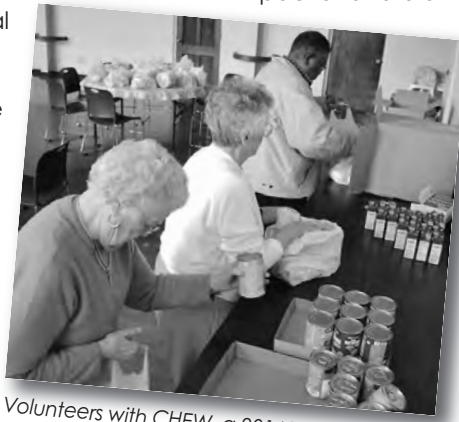
Volunteers with CHEW, a 2014 Thank Offering recipient in Wilson County, North Carolina, pull food for hungry schoolchildren.