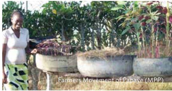
Farmers Movement of Papaye (MPP)

Grain banks allow communities to store surplus grain so people can avoid high seed prices and food insecurity during less fruitful growing seasons. The United Nations has praised village-run grain banks as a successful method of providing food security that empowers farmers and rural communities.