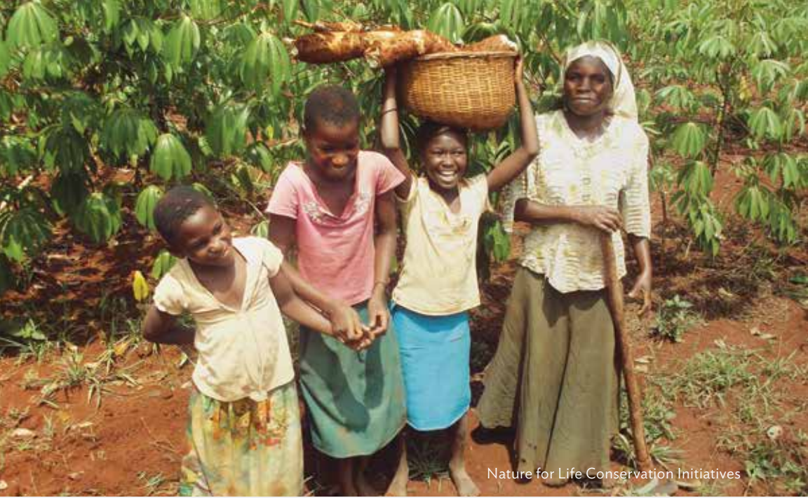
Nature for Life Conservation Initiatives