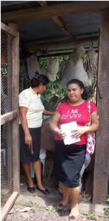
▲ Women's greenhouse cooperative.