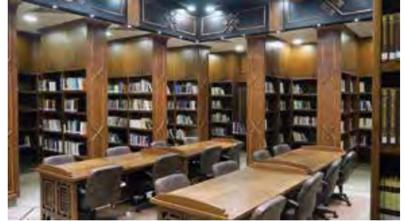
The new Center for Middle Eastern Christianity in Cairo, Egypt, celebrated its grand opening in April

Evangelical Theological Seminary in Cairo was founded in 1863 by Presbyterian missionaries and is now one of the major Christian theological seminaries in the Middle East. Construction of CMEC began in May 2005 and was completed last year. The facilities include a library, offices, and lecture halls. Careful attention was paid to decorative elements in the design of the center, reflecting classical Coptic Egyptian motifs.