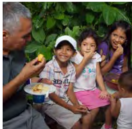
◀ Children are eating the jocote fruit grown on their local farm, which is a cooperative of local rural farmers. The farmers use sustainable, organic agricultural processes.