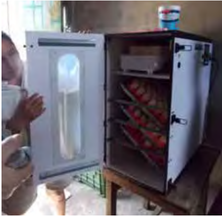
◀ The women's cooperative raises chickens in this incubator, which is housed inside this woman's home.