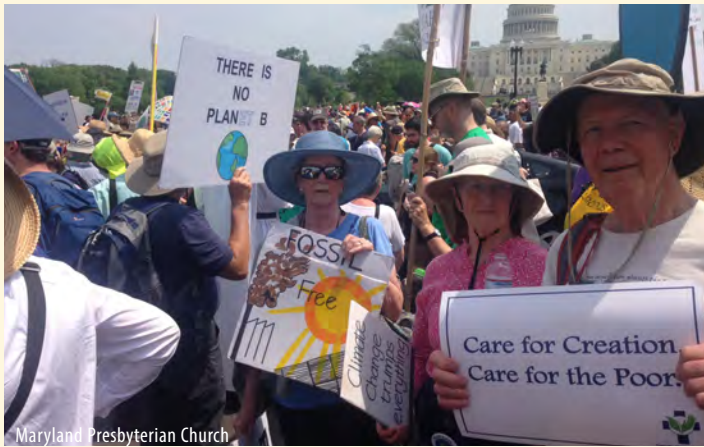
Maryland Presbyterian Church