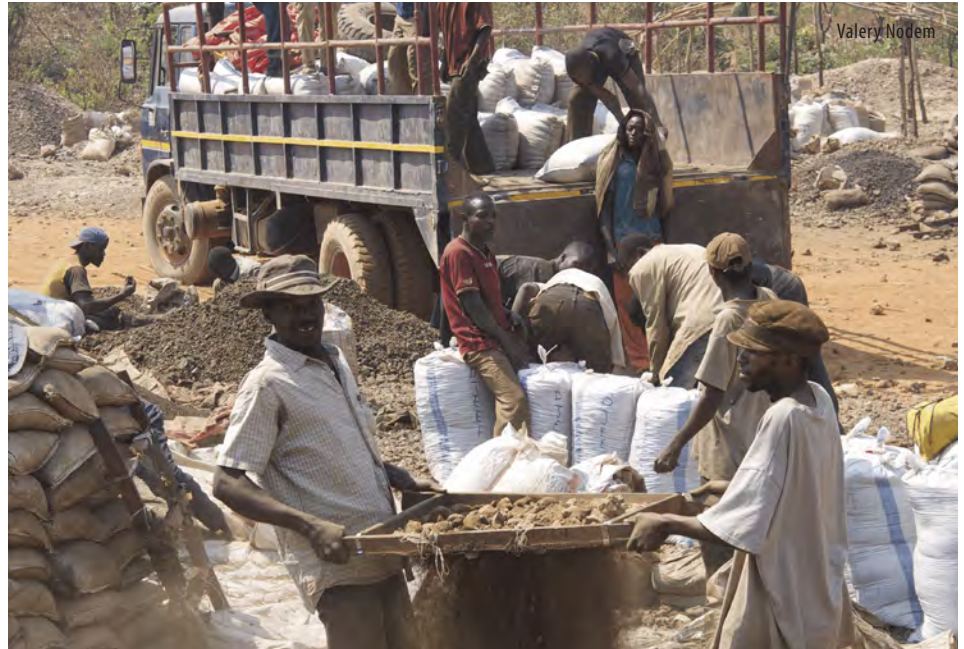
Men sift cobalt at an artisanal mine in Lubumbashi, DR Congo.

communities are actively participating in the crafting of community development guidelines for the revision of the mining code.