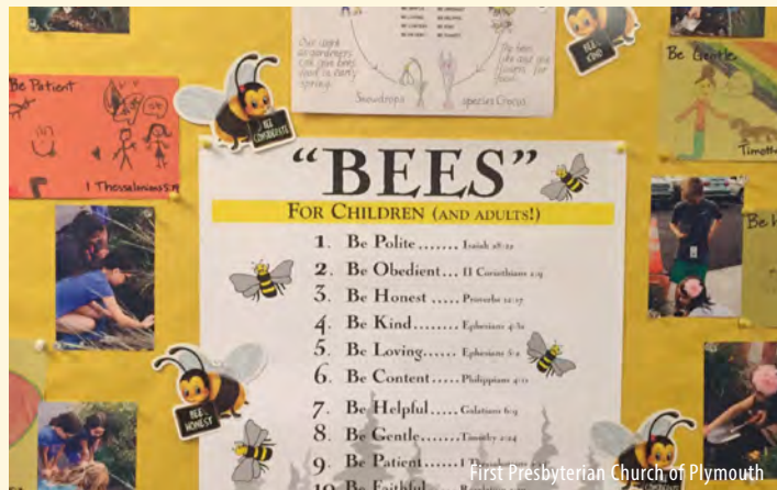
First Presbyterian Church of Plymouth

OUTREACH: Maryland Presbyterian Church, Towson, MD. One of the first Earth Care Congregations, piloting the program in 2009 for certification in 2010. They have grown and deepened in their ministry and witness ever since, tackling storm water management, energy efficiency, creating a congregational covenant, educating area children, and more. For the outreach portion of their earth care ministry, members of the church participated in the 2017 Washington D.C. Climate March.