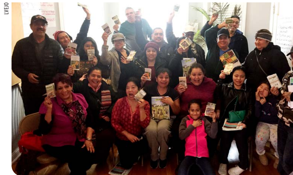
Las Semillas gardeners with seeds.