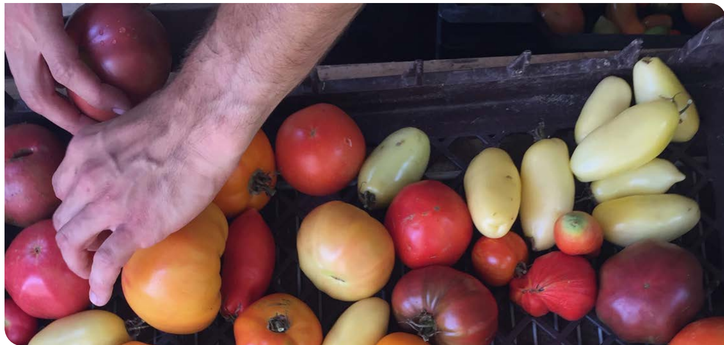
The Open Door Presbyterian Church