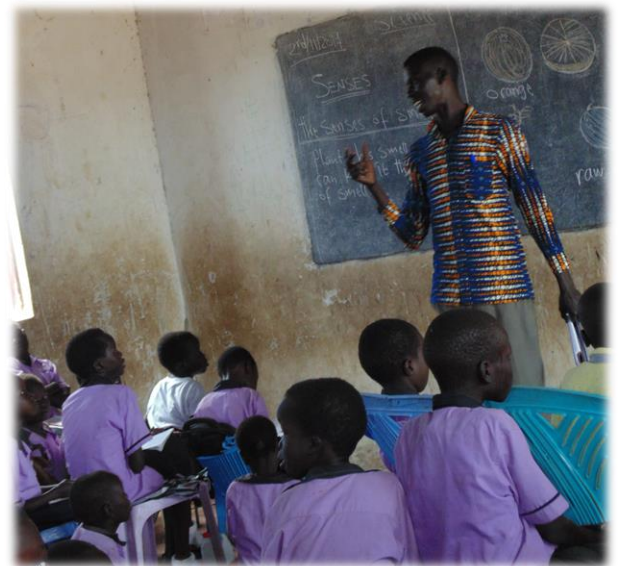
PCOSS scholarship student teacher in action.