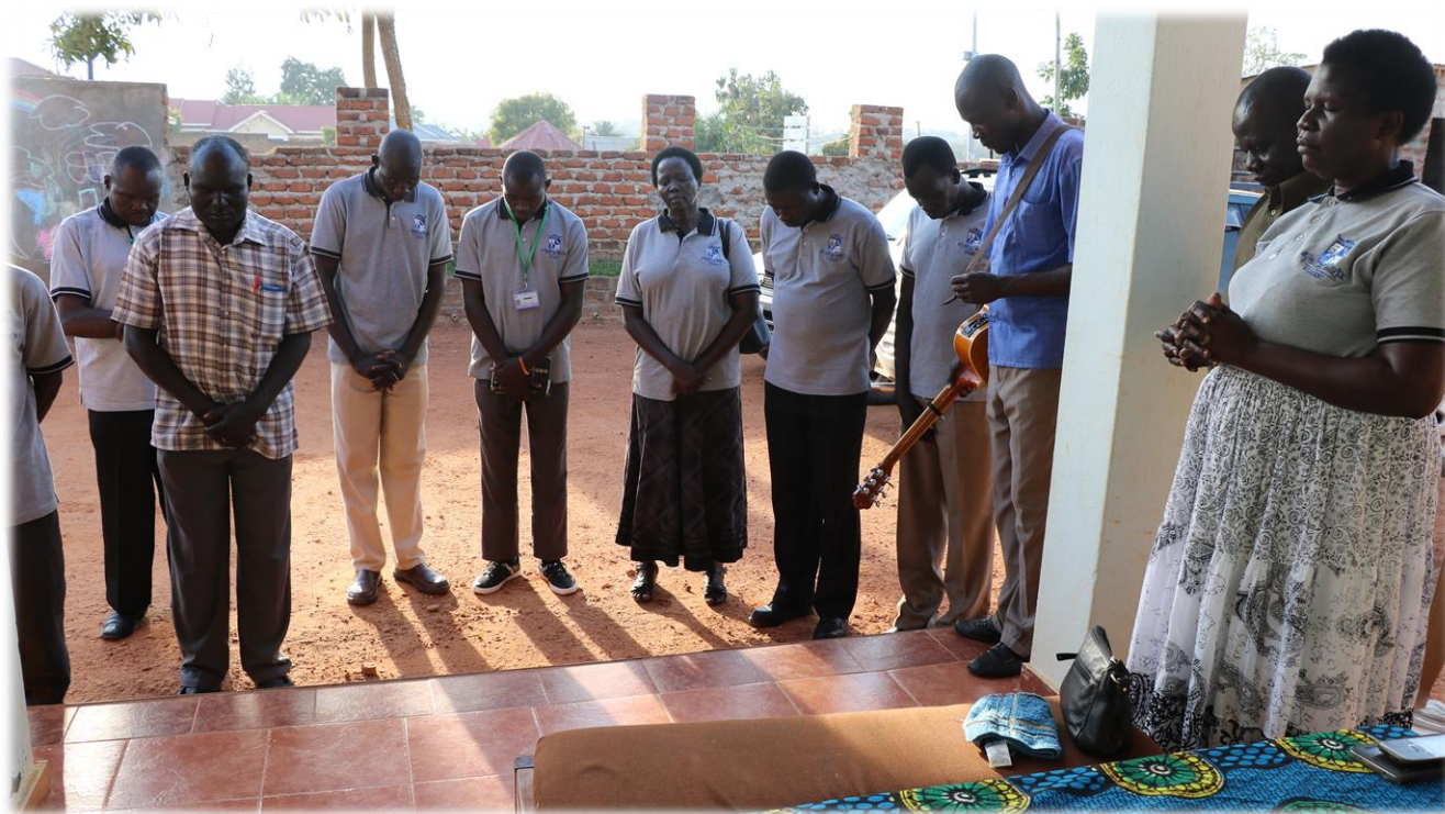
South Sudanese pastors and church leaders pray before entering the Smith-Mather’s home in Uganda.