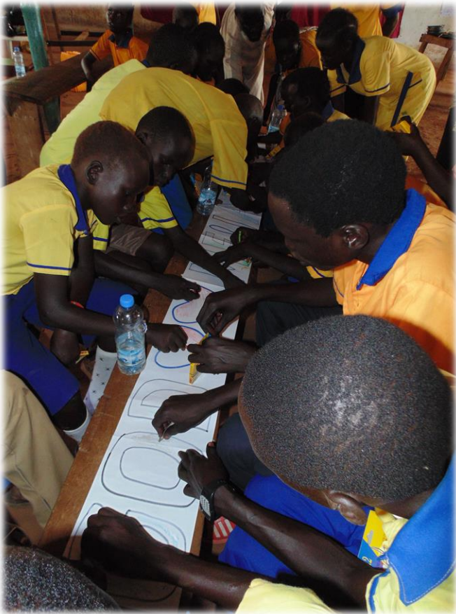
Creating a “God loves me! I am special!” banner.