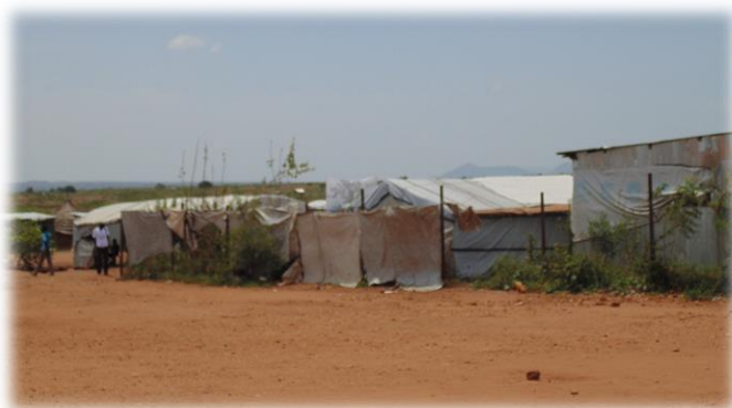
The view of the camp from the classroom window.

Trauma Healing with Pastors: “The teaching of trauma healing is really more important to me, it helped me. What is more important is how to help those who are grieved, because one-third of our people are grieved. It is most helpful for we South Sudanese, because we have