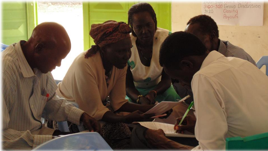
Joining forces for education.

May God give you the grace not to sell yourselves short as instruments of God's healing in the world. May God give you the grace to risk something big for something good. May God give you the grace to remember that the world is now too dangerous for anything but truth and too small for anything but love.