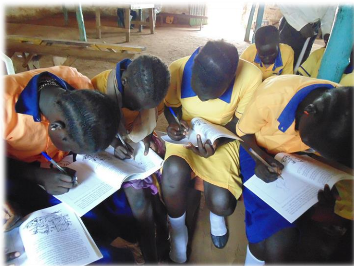
Children complete the activity using their laps as desks.

During the training, each participant was asked to think of a very painful experience or memory. The instructions were clearly understood, but choosing was difficult. There had been so much terror, and the bad recollections far outweighed the more pleasant ones. All their vivid responses related to the war as they talked freely of killed relatives, running through the “tall grasses,” homes being torched “by those with guns,” anger, lack of good education, and “maybe no future.”