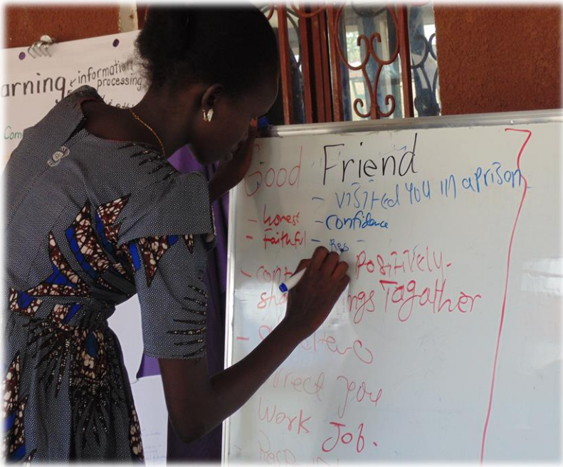
Children’s capacity building activity on choosing good friends.