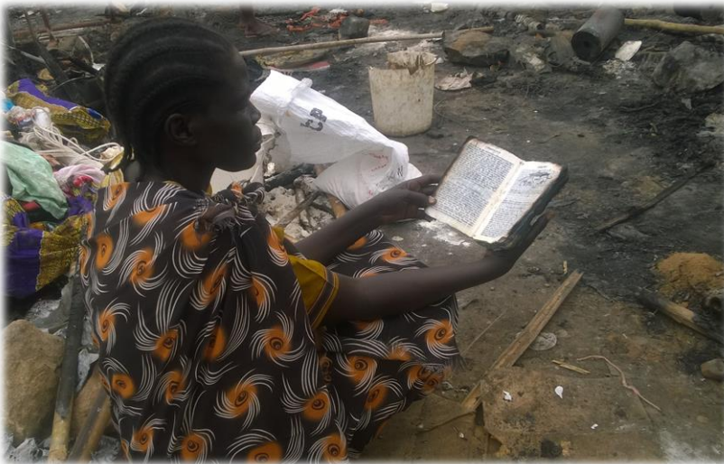
Finding strength to go on after fire destroys property in Juba.