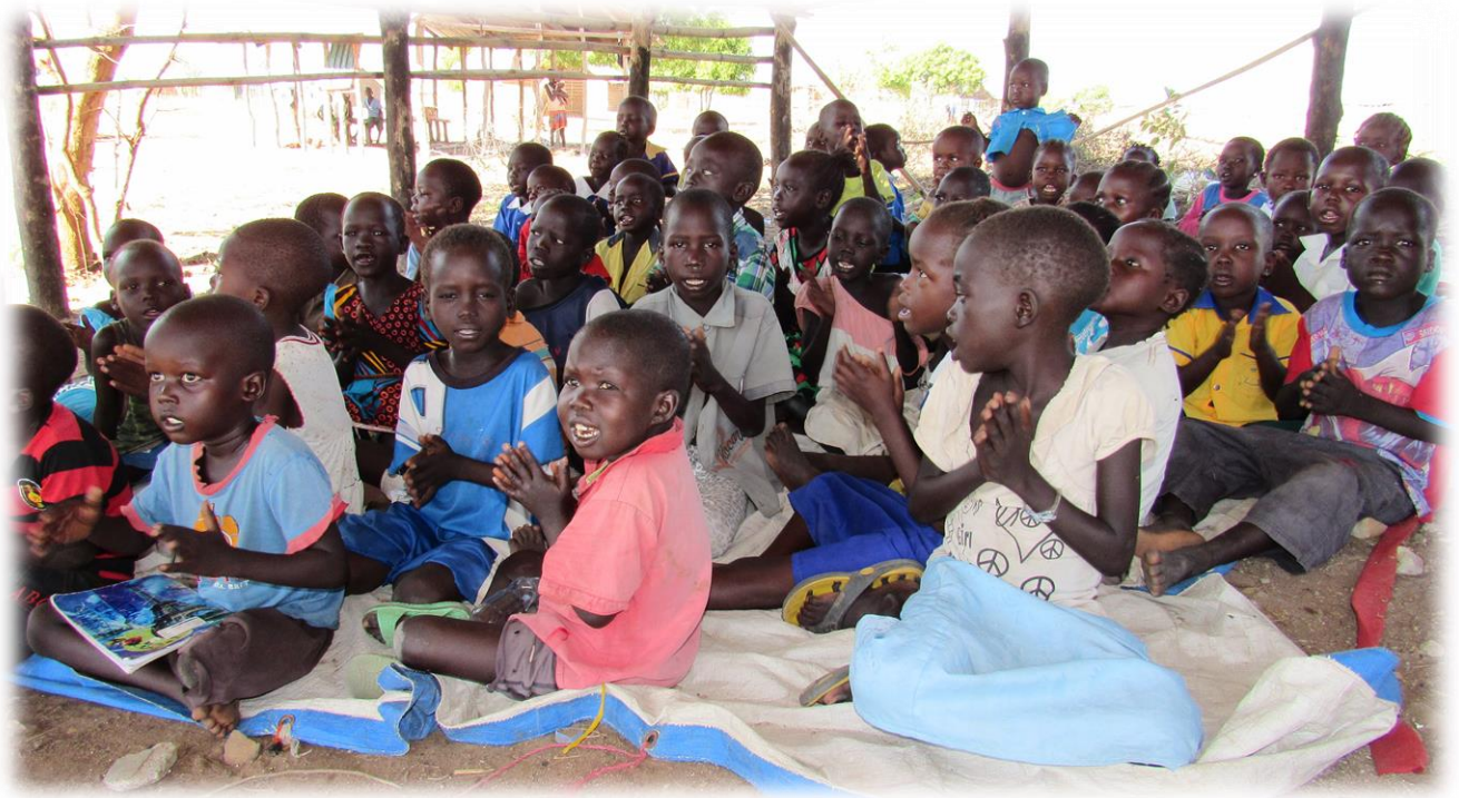
"Baby Class" at a PCOSS School in Juba.

Since the start of the year, $109,723.28 has been raised in support of the South Sudan Education and Peacebuilding Project. These new funds include Westminster Presbyterian Church’s matching of last year’s gifts. They are committed to a 38% match for all contributions for the project. We give God thanks for the continued commitment of churches, mid-councils, and individuals who are partnering financially with our South Sudanese sisters and brothers during this difficult time. Thank you!