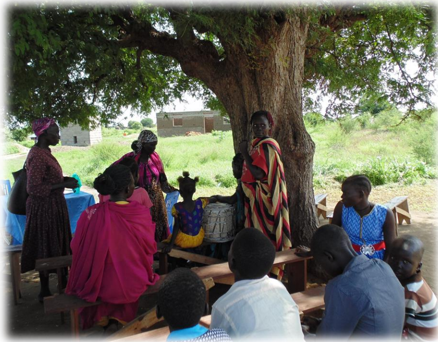
Education Stakeholders Meet in Kasera Community, Juba.