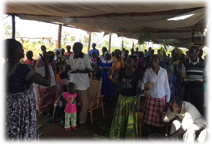
South Sudanese Refugees Gather for Worship in the Midst of Tragedy.

“What do we do now Pastor?” his members asked, after soldiers killed one of their church elders.