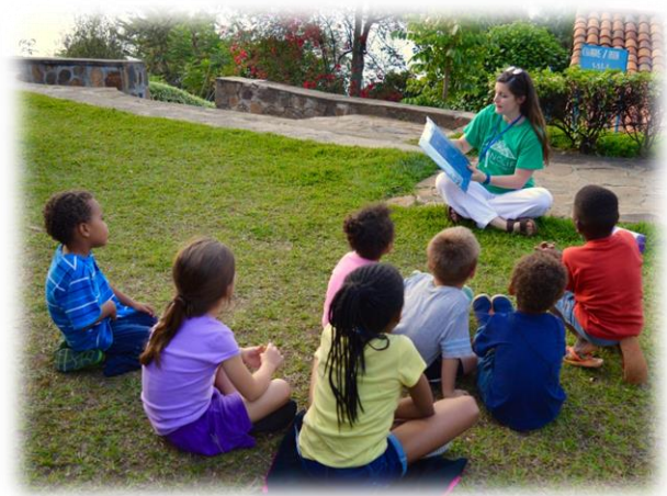
Children loved the program for mission co-worker families at the Rwanda gathering.