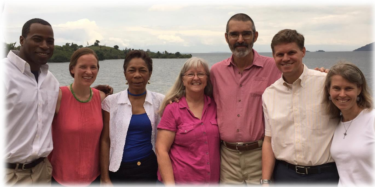
South Sudan mission co-workers.

from our partner church in Rwanda, at the continent-wide Mission co-worker gathering. God worked in each of our hearts, and here is one testimony: