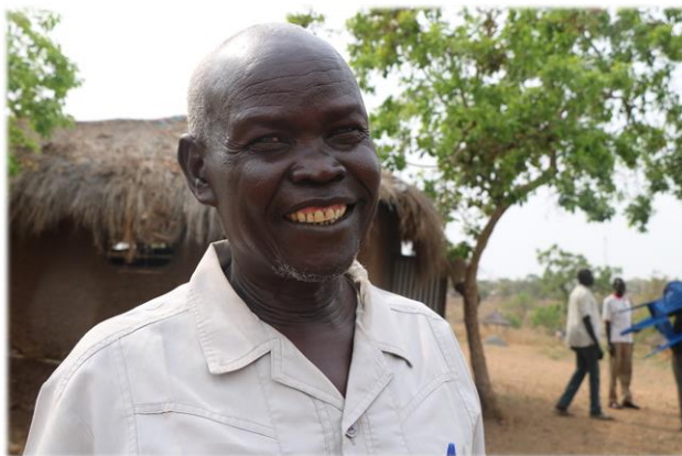
He took a loan from the IGA group and got back on his feet again