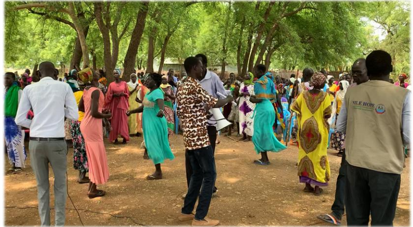
Dancing on International Women’s Day in Pochalla, South Sudan