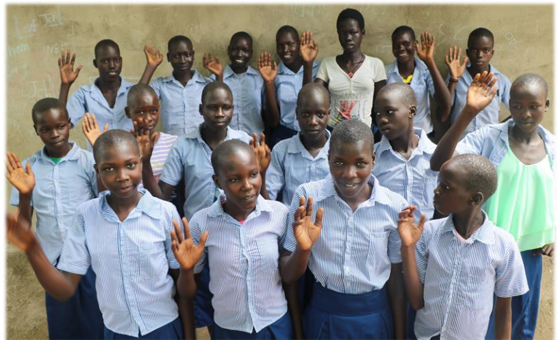
Girls on scholarship through SSEPP in Pochalla, South Sudan

A global pandemic presents challenges for fundraising, while at the same time increasing our desire to remain connected with global partners. Please continue to lift up our South Sudanese sisters and brothers in prayer, an important and powerful way to stay linked in the