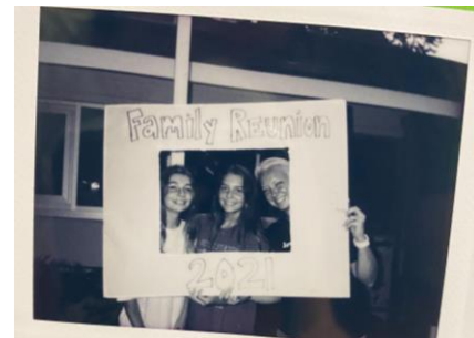
Photo Booth and Family Tree: Make a large empty photo frame with the words FAMILY REUNION and the year of the event. Using a polaroid camera, have individuals or a group pose for a picture. When the photo develops, hang it on a nearby tree or pole that is labelled “family tree.” This can serve as a reminder that we are all part of God’s family.