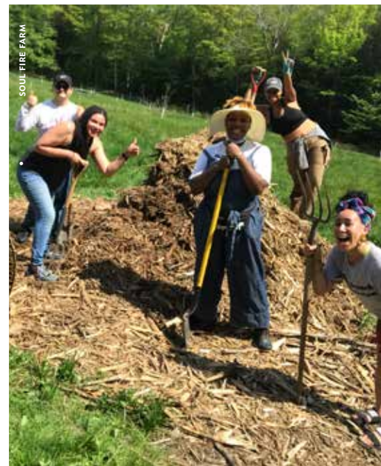
SOUL FIRE FARM