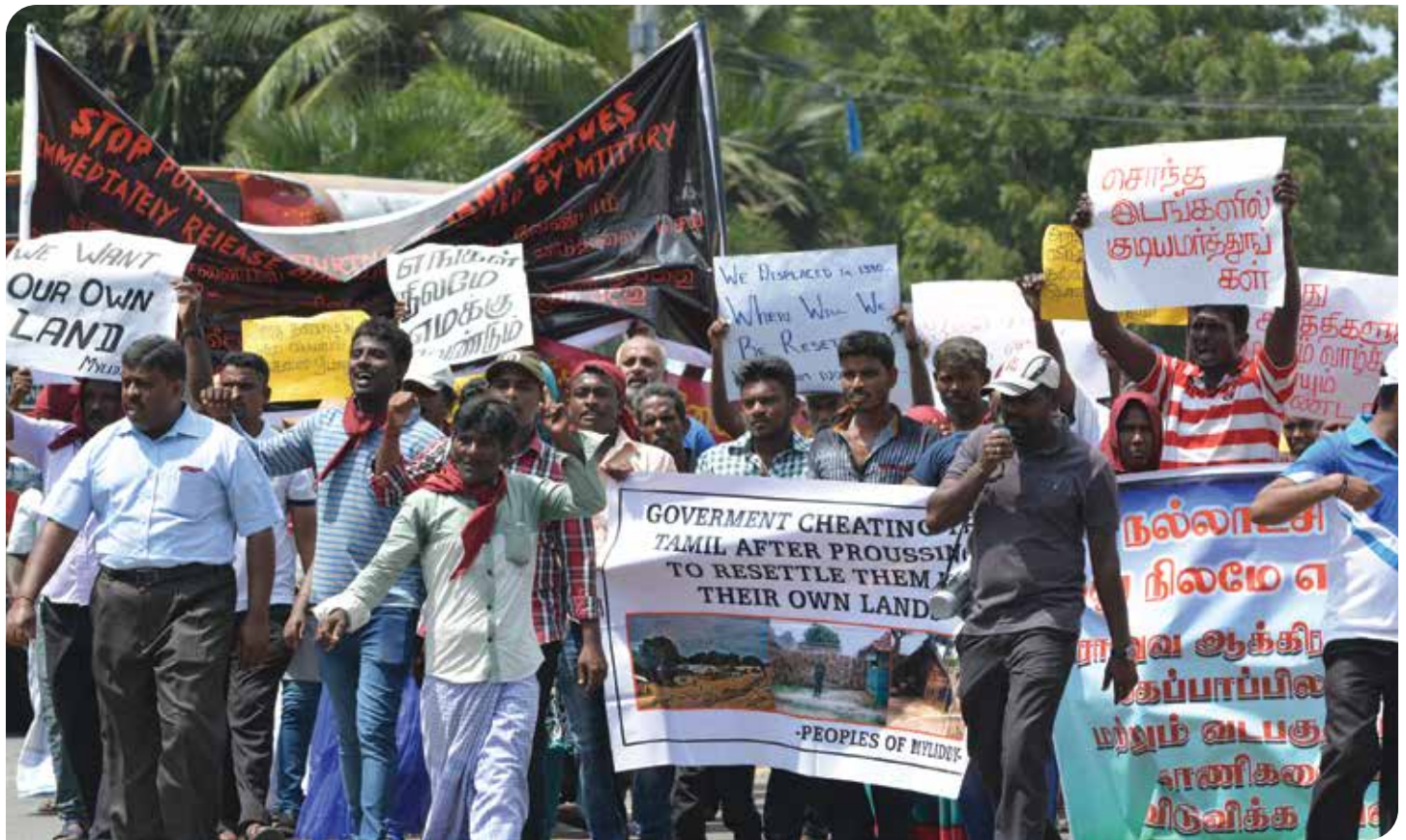
Sri Lankans march to demand that their stolen lands be returned.

It is nearly impossible to start the day without laying your hands on something — some product — that cannot be traced to distant lands and the peoples who occupy them.