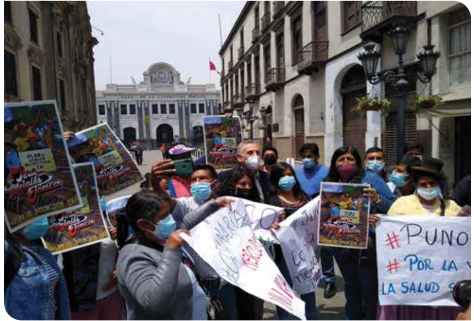
Peruvians impacted by mining contamination demand a Public Health Care Plan.

GSN is a place for Presbyterians with a heart for global relationships who are also committed to the Matthew 25 visions of