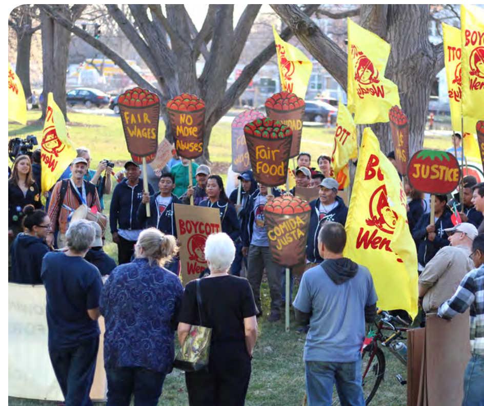
Presbyterians in Louisville join the circle of farmworkers from the Coalition of Immokalee Workers (CIW) and allies for a rally on the University of Louisville campus, which hosts a Wendy's franchise.

Almost eighteen years later, I am still in the saddle, and PHP continues to gallop along working with Presbyterians and partners to dismantle systems that perpetuate hunger, homelessness, poverty, exploitation, environmental racism, and climate chaos.