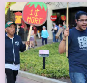
2002 PC(USA) votes to support Taco Bell boycott