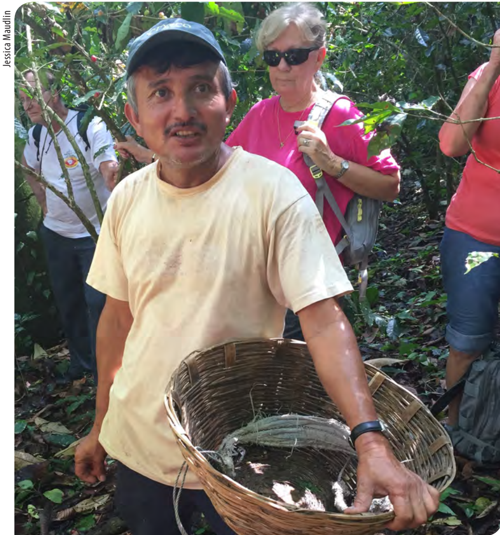
The Café Justo cooperative in Mexico has been a long time participant in PHP's Global Marketplace which offers Fair Trade goods at PC(USA) events. Café Justo is helping keep farmers on their land and families together. This photograph taken on a Border to Border Delegation, sponsored by Café Justo, shows one of the members of Café Justo cooperative explaining the coffee picking process to a group of Presbyterians.