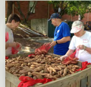
2017 Hunger Action Congregations initiative launches