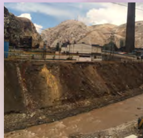
1995 PC(USA) passes "Hazardous Waste, Race, and the Environment" policy