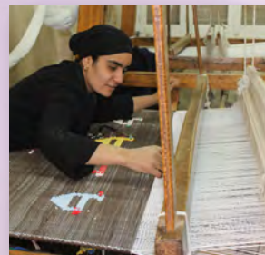
2000 Joining Hands and Enough for Everyone initiatives launch