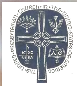
1975 UPCUSA launches hunger program