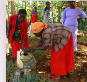
2007 Eco-Palm project & West Africa Initiative launches