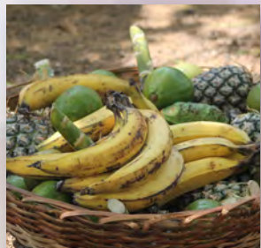
1987 PC(USA) adopts the Common Affirmation on Global Hunger