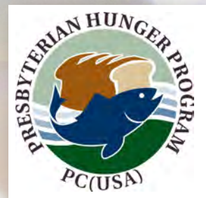
1981 PCUS and UPCUSA merge hunger programs