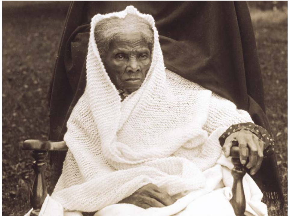
Harriet Tubman, circa 1911. Photographer unknown. Library of Congress CALL NUMBER: Illus. in JK1881 .N357 sec. 16, No. 9 NAWSA Coll [Rare Book RR]

Nature also served as an avenue for escape. Harriet Tubman, like many Black women before her, had an intimate ancestral