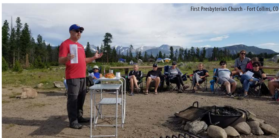
First Presbyterian Church - Fort Collins, CO