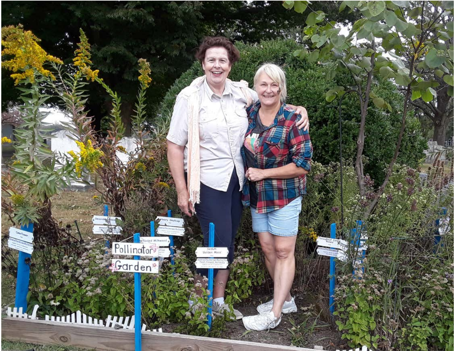
Members of Churchville Presbyterian during their Fall Heritage/Family Festival, during which they celebrated the 200th Anniversary of their sanctuary.