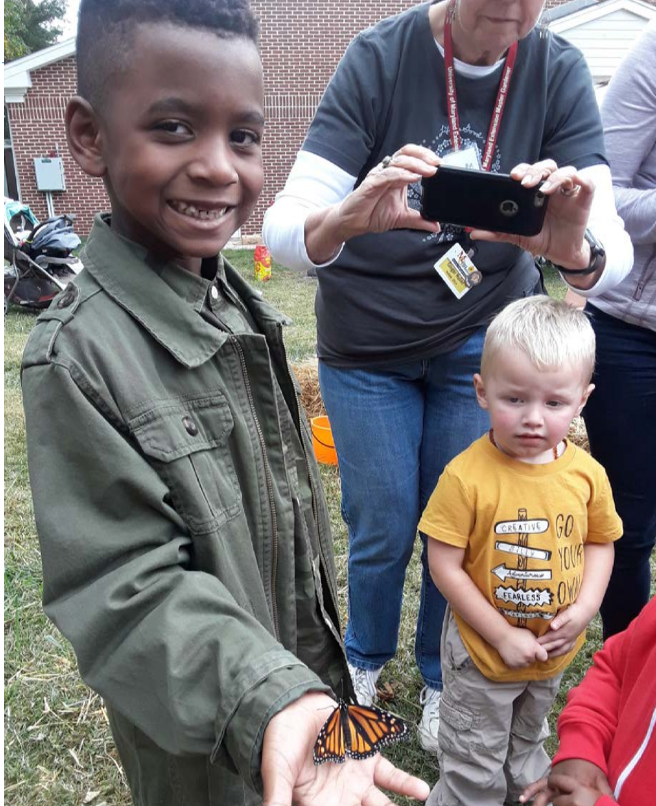
Churchville Presbyterian used their Fall Heritage/Family Festival to do butterfly education in a way that was multi-generational. During the event they were able to tag six, wild-caught Monarchs from their Pollinators Garden.