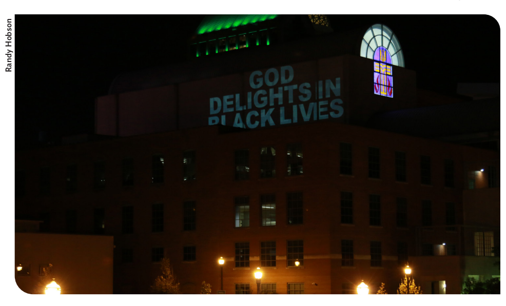
Excerpts from Presbyterian policy statements on racial justice—such as "God delights in Black lives"-- were projected onto the PC(USA) national office building in Louisville, KY in summer 2020.

The second Sunday in November can be a focus on Hunger and Homelessness Sunday. Find resources at www.pcusa.org/homelessness.