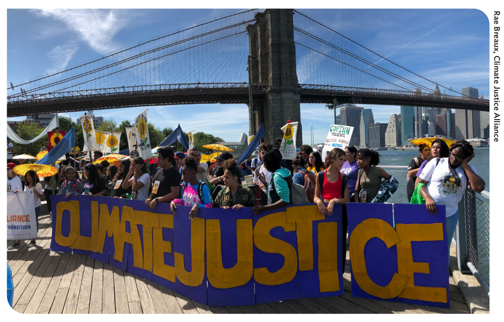
One grant partner supported by the PHP Advisory Committee is Climate Justice Alliance, which among many other things, galvanizes youth and others to march for climate justice for historically harmed and disadvantaged populations

"Decolonizing Wealth" centers the discussion of philanthropy and grantmaking – the main financial approach that PHP utilizes - around colonization. For centuries, our world's history has included and been rooted in dividing, conquering and exploiting people. We have formed haves and have-nots, whether they be identified by the country where they live, the color of their skin, the way they speak, education level, gender or any other of the myriad ways in which we separate one from another. This impacts the way PHP and all of philanthropic and granting groups work, for "[t]he basis of traditional philanthropy is to preserve wealth, and that wealth is fundamentally money that's been twice stolen: once through the exploitation of natural resources and cheap labor, and the second time, through tax evasion."