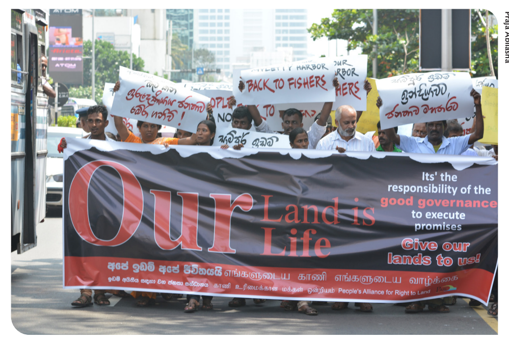
Protests from PHP Joining Hands network Praja Abilasha in Sri Lanka, standing with other partners against the eviction of farmers and fishermen from their lands for tourism projects.

For the past 20 years, RUMP has been accompanying the people of La Oroya who are present-day victims of such thirst for gold. La Oroya is often considered one of the 10 most contaminated places in the world, where almost 99% of the children have been shown to have extreme levels of lead in their blood. The cause of the contamination is a metals smelter owned by a U.S.-based corporation. After pressure from RUMP and others in civil society for the government to enforce environmental regulations, the smelter declared bankruptcy. It claimed