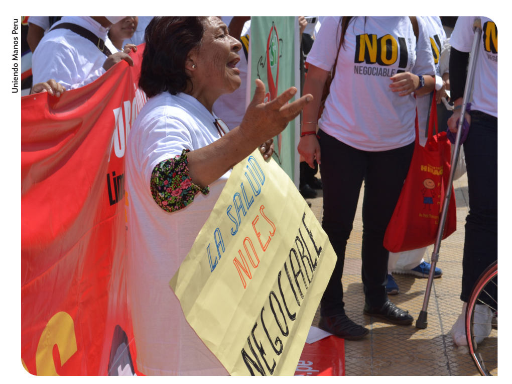
Mining contamination over the last decades has seriously affected people's health and contributed in many deaths in communities.