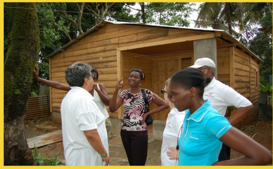
National Committee members visiting a Batey in Dominican Republic

Being a part of this ministry provides an opportunity to positively impact the lives of economically poor, oppressed, and disadvantaged people around the world. We hope you will consider serving on the National Committee. If you, or someone that you know would be interested, please visit (or encourage them to visit) the General Assembly Nominating Committee (GANC) website www.pcusa.org/nominations for the nominating form. Interested individuals must complete this form and submit it to the GANC. Check with GANC for deadlines.