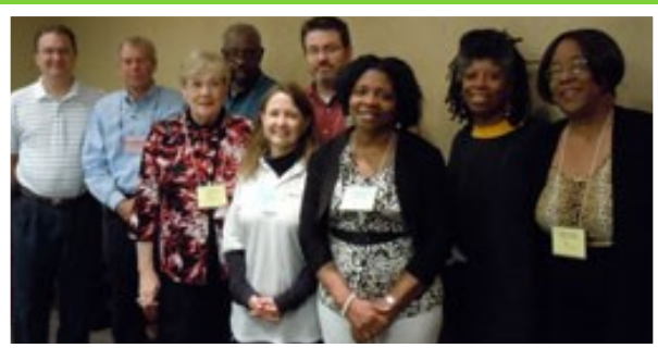
Former National Committee Members

Self-Development of People is a ministry that affirms God's concern for humankind. We are Presbyterians and ecumenical partners, dissatisfied with poverty and oppression, united in faith and action through sharing, confronting and enabling. We participate in the empowerment of economically poor, oppressed and disadvantaged people who are seeking to change the structures that perpetuate poverty, oppression and injustice.