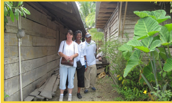
National Committee members visiting a community in Belize