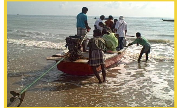
National Committee member visiting a fishermen's project in India.

The National Committee meets three times a year (January, May and September). Task Forces meet in conjunction with the National Committee and between each National meeting. Standing Committees meet in conjunction with National Committee meetings. Each member is assigned to serve on a regional Task Force, and Standing Committee (Community and Church-wide Relations, Personnel) or the International Task Force. The International Task Force meeting schedule is similar to other Task Forces. Committee members are responsible for conducting site visits to potential partners in the United States, conducting training sessions for Synod/Presbytery SDOP Committees and leading workshops for community groups. Currently meeting via zoom.