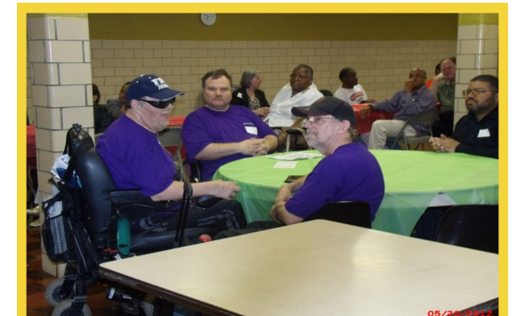
National Committee members during gathering with local groups in Detroit, MI

The National Committee meets three times a year (January, May and September). Task Forces meet in conjunction with the National Committee and between each National meeting. Standing Committees meet in conjunction with National Committee meetings. Each member is assigned to serve on a regional Task Force, and Standing Committee (Community and Church-wide Relations, Personnel) or the International Task Force. The International Task Force meeting schedule is similar to other Task Forces. Committee members are responsible for conducting site visits to potential partners in the United States, conducting training sessions for Synod/Presbytery SDOP Committees and leading workshops for community groups. Currently meeting via zoom.