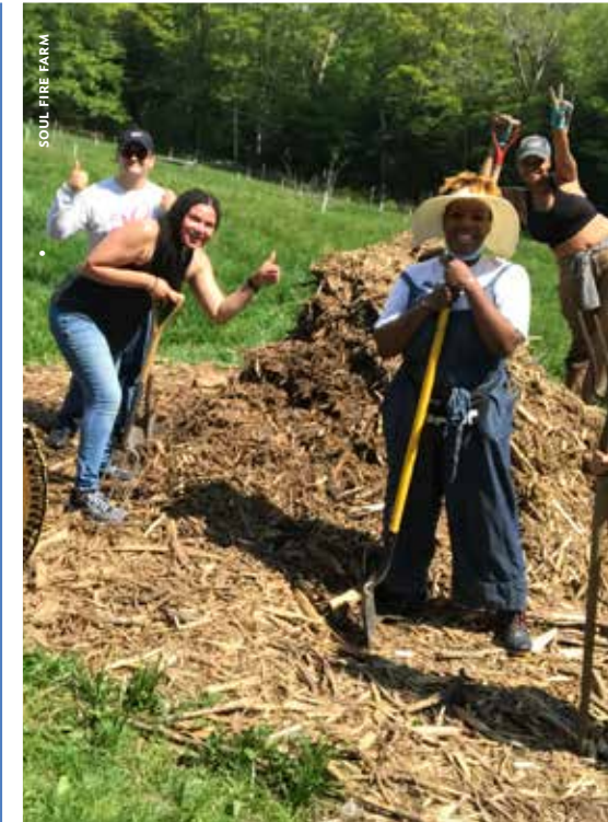
SOUL FIRE FARM