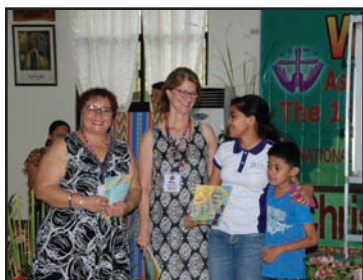
2014 Fellowship of the Least Coin Celebration, Philippines

The PW Mission Pledge supports every mission and ministry of PW—no exceptions. Here is what was made possible in 2014 and 2015 because of your generosity: