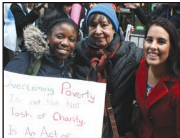
2015 Commission on the Status of Women (CSW)