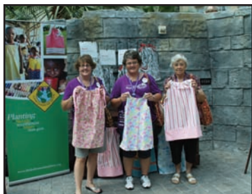
Little Dresses for Africa at the 2012 Churchwide Gathering