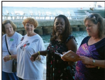
Closing worship of the 2014 Global Exchange to the Caribbean