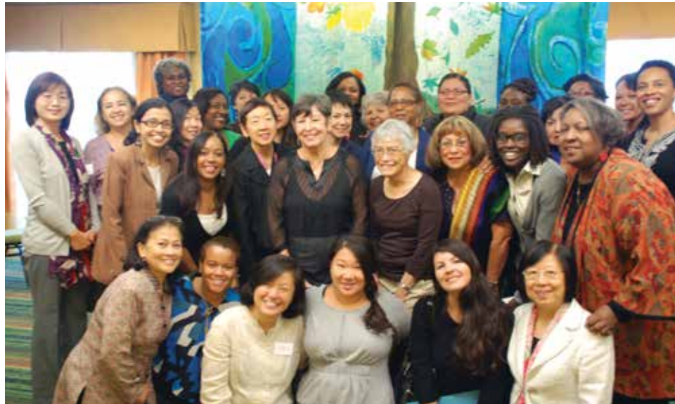
More than forty women from across the United States gathered in Louisville to participate in the two-day 2013 Women of Color Consultation.

backgrounds for mutual empowerment and collective action;