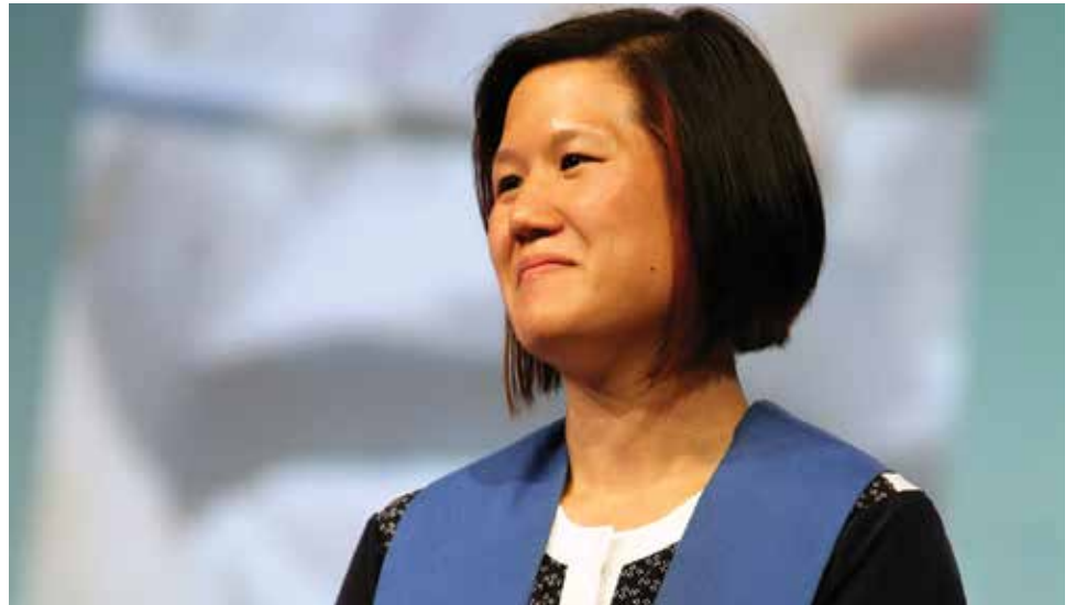
General Assembly Vice-moderator Larissa Kwong Abazia delivers a sermon during the annual Moderators Conference in November.

On the General Assembly’s recent vote to permit same-sex marriages in the church, there are those who are celebrating and those who are mourning, Kwong Abazia acknowledged. More than 220 churches have left the PC(USA). “And those who stay are faced with the ongoing pressure that they have conformed, giving up their long-held