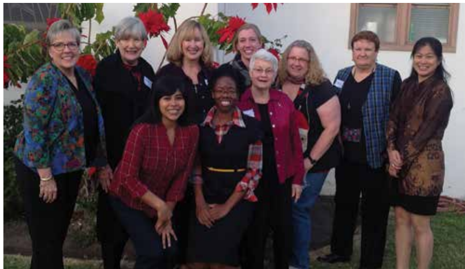
Women gathered at St. Paul Presbyterian Church in Los Angeles for a Women’s Listening event last fall.

“Addressing issues raised during these events, and others like them held in previous