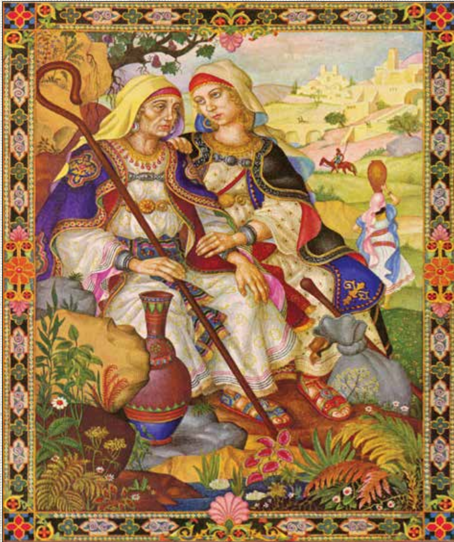
Ruth and Naomi on the Road to Bethlehem, Arthur Szyk.