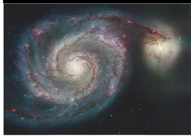
Whirlpool Galaxy (M51a aka NGC 5194). The smaller object on the right is M51b aka NGC 5195